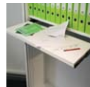
glide out work-shelf