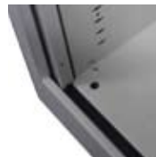
levelling foot access