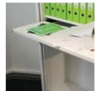
pull-out reference shelf