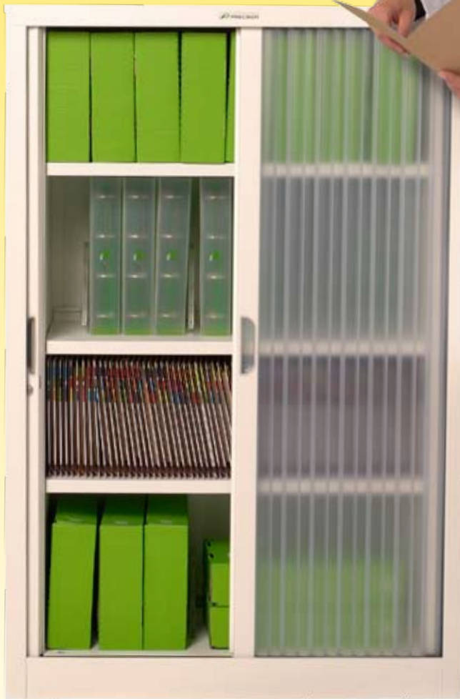
Smartstore 4 level 900mm wide

Precision will take your organisation to new heights because organisation is simply about efficiency. Smartstore is so efficient we almost called it the 'personal assistant', but then we didn't want to upset anyone.